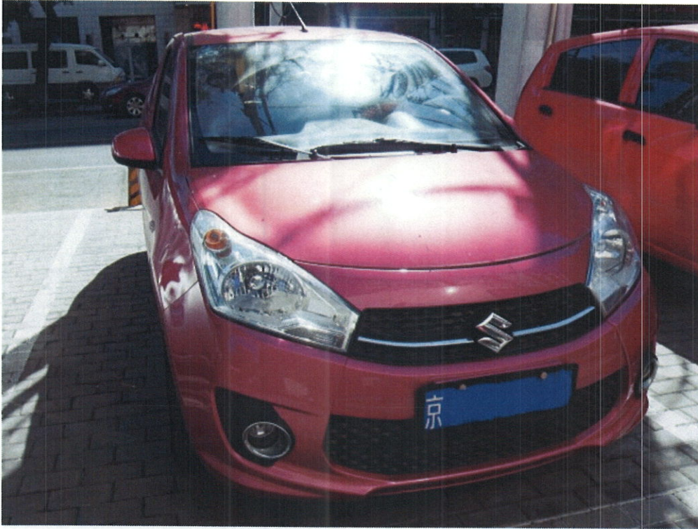
Figure 4 A small pink car, Beijing